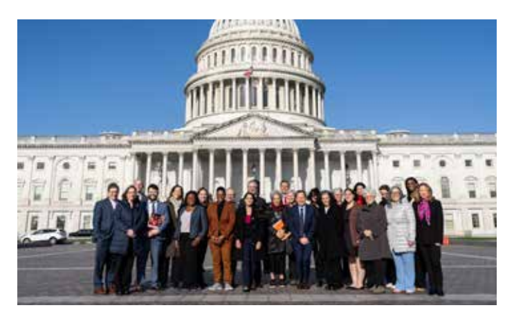
Jewish leaders from AJWS's Global Justice Fellowship, AJWS staff and board members convene in Washington, D.C., to meet with elected leaders and urge Congress to join our movement for human rights.

Meanwhile, AJWS staff in Washington, D.C., and a base of rabbis, cantors, Jewish leaders and supporters advocate to Congress and the executive agencies to protect and promote the rights of marginalized people everywhere.