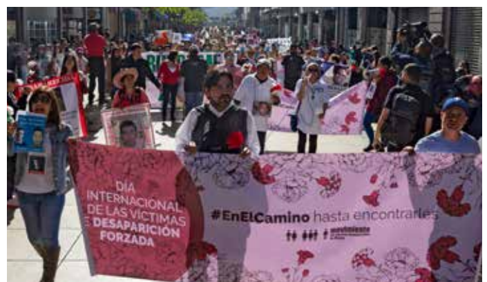
In a nationwide protest organized by AJWS grantee MovNDmx, Mexican activists took to the streets of Mexico City and 18 other cities on International Day Against Forced Disappearances.

We believe that realizing human rights is the essential first step to creating just societies. When people are empowered to shape solutions to the problems they face, they can overcome poverty, live with dignity and transform the lives of others. Additionally, we believe that promoting human rights is a way to act on the Jewish traditions of repairing the world and respecting the inherent dignity of all human beings.