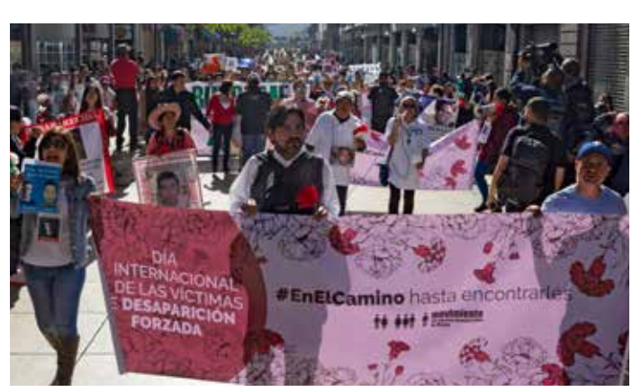
In a nationwide protest organized by AJWS grantee MovNDmx, Mexican activists took to the streets of Mexico City and 18 other cities on International Day Against Forced Disappearances.

We believe that realizing human rights is the essential first step to creating just societies. When people are empowered to shape solutions to the problems they face, they can overcome poverty, live with dignity and transform the lives of others. Additionally, we believe that promoting human rights is a way to act on the Jewish traditions of repairing the world and respecting the inherent dignity of all human beings.