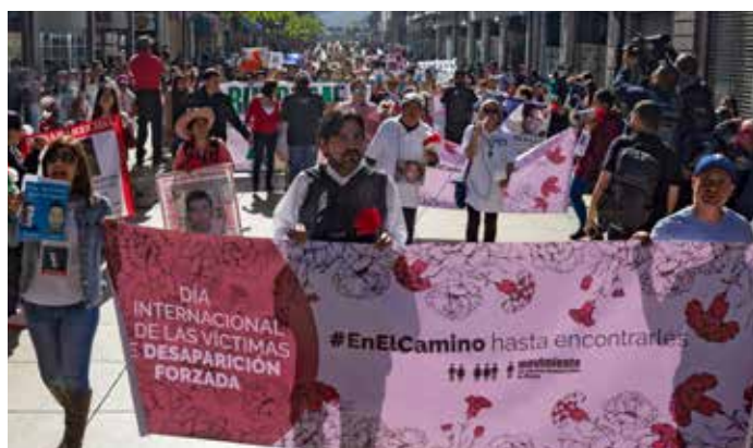
In a nationwide protest organized by AJWS grantee MovNDmx, Mexican activists took to the streets of Mexico City and 18 other cities on International Day Against Forced Disappearances.

We believe that realizing human rights is the essential first step to creating just societies. When people are empowered to shape solutions to the problems they face, they can overcome poverty, live with dignity and transform the lives of others. Additionally, we believe that promoting human rights is a way to act on the Jewish traditions of repairing the world and respecting the inherent dignity of all human beings.