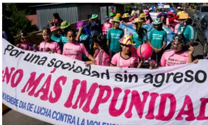
Nicaraguan women marching for gender equality.

We believe that realizing human rights is the essential first step to creating just societies. When people are empowered to shape solutions to the problems they face, they can overcome poverty, live with dignity and transform the lives of others. Additionally, we believe that promoting human rights is a way to act on the Jewish traditions of repairing the world and respecting the inherent dignity of all human beings.