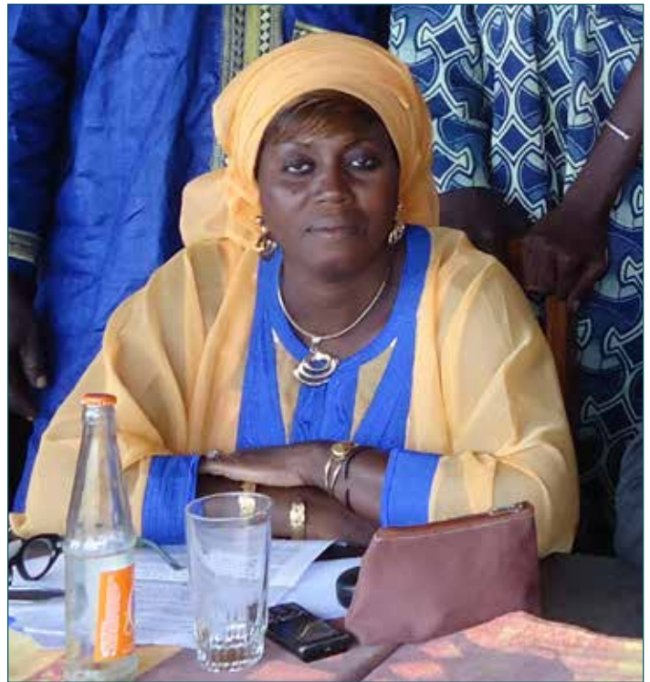
ASAPID is restoring livelihoods disrupted by the conflict.

ACTION: AJWS grantees have helped restore livelihoods and rebuild houses, schools and healthcare centers. Construire la Paix par le Développement Économique et Social (COPI) and its partners are helping women