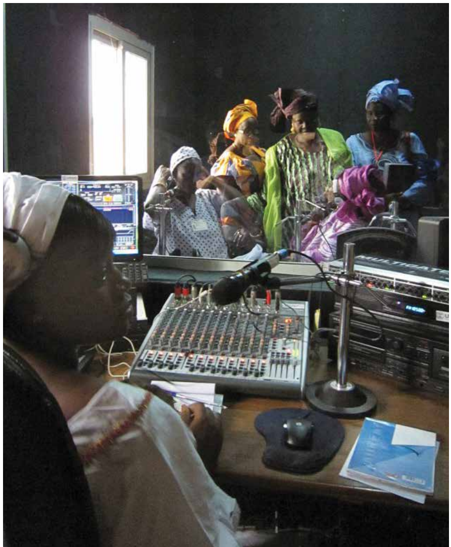
The first-ever women-led radio station in Casamance, founded by AJWS grantee UR Santa Yalla

VISION: After this study was conducted, AJWS brought together AJWS grantees PFPC , Dynamique de Paix en