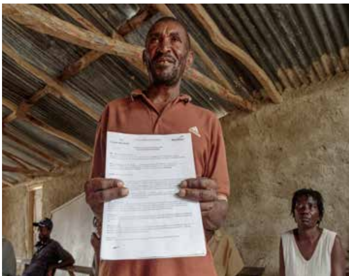
ABOVE AJWS grantee Mining Justice Collective fights corporate mining interests that threaten to displace communities and ruin Haiti's environment. TOP RIGHT AJWS grantee Fonkoze helped earthquake survivors get back on their feet financially after the disaster.

The grassroots organizations AJWS supports in Haiti are working to rebuild their country as a more just society. They are focused on aiding the poor and vulnerable communities that were both hardest hit by the earthquake and, unfortunately, neglected by international aid efforts.