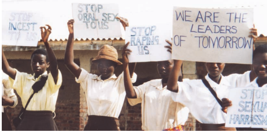
Young women of Girl Child Network conduct a protest