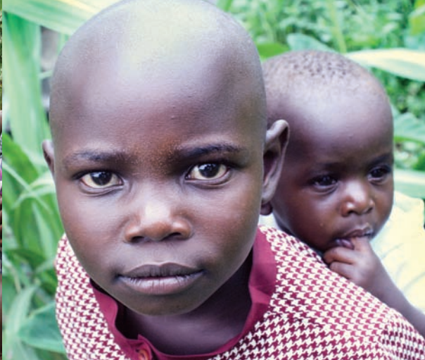
(Right) Siblings in a rural village served by THETA.