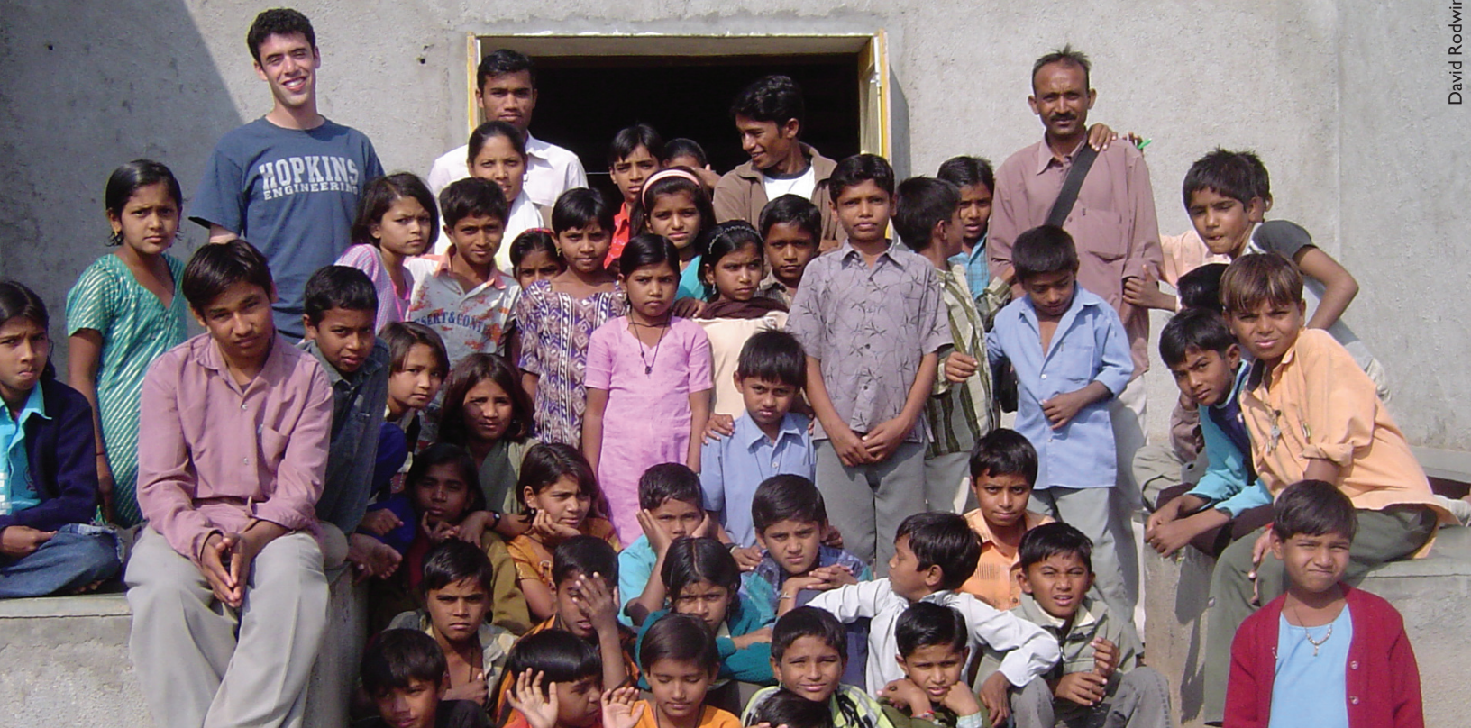
The author (top left) at a Dalit primary school in Katariya