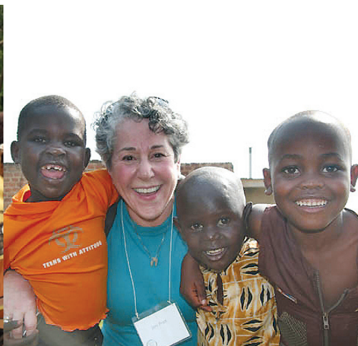
(Center) FDNC greeting committee in a rural village.