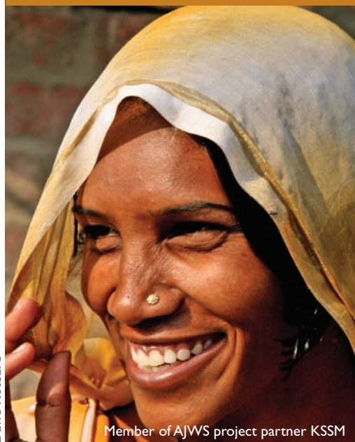
Member of AJWS project partner KSSM

Visit New Delhi, Mumbai and the eastern state of Orissa for an unforgettable and rare exchange with communities on the margins of Indian society. Meet community activists and leaders supported by AJWS who are providing hope and promoting change across gender, caste and educational lines. Tour Moghul monuments in New Delhi, shop in Mumbai and admire the Sun Temple in Orissa. The AJWS Study Tour will provide unique insight into India's history, culture and politics through conversations with the country's leading politicians, journalists, academics and elected officials. This promises to be an extraordinary journey!