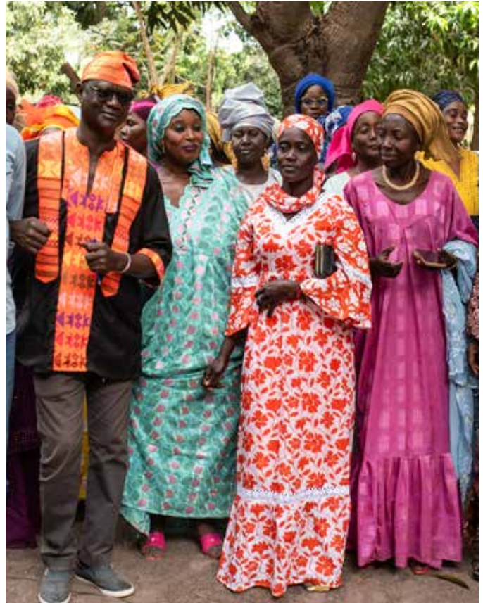
In southern Senegal, COSPAC, a coalition of grassroots organizations working to end a regional armed conflict, lost significant funding in 2025.

Human rights defenders, marginalized communities and those across the world who support them are tackling tremendous hurdles amid an uncertain future. While AJWS cannot make up for U.S. government cuts, we can invest in the strongest and most important social movement actors who will have an outsized and long-term presence. AJWS was made for times like these, and our accompaniment work and grantmaking are more important than ever. Resources from AJWS are providing flexible and reliable safety nets to grantees who must make difficult and strategic choices.