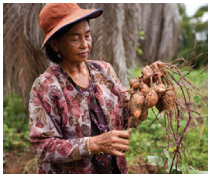
A WOMAN OF THE SOUTHERN FARMER ALLIANCE (SFA) SAI NGAM COMMUNITY CULTIVATES POTATOES. PHOTO JAMES ROBERT FULLER

percentage of both total U.S. agricultural production and total U.S. agricultural exports.<sup>28</sup> Moreover, as is discussed in the next section, high farm commodity prices and the lack of surpluses have led successive federal administrations to phase out the use of the export-development-oriented titles (I and III) of PL 480. This means that status quo supporters can no longer claim that the development of foreign markets for U.S. agriculture is an active objective of the program.