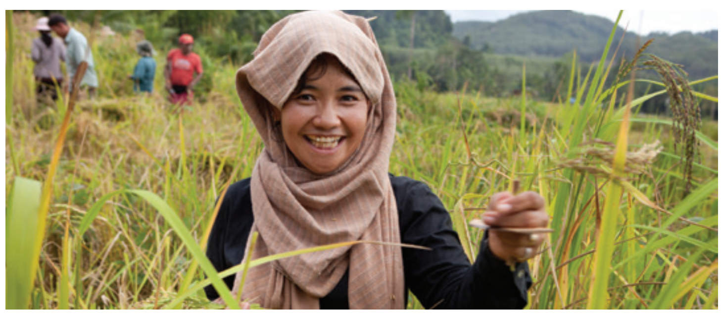
FARMERS OF THE SOUTHERN FARMER ALLIANCE (SFA) HARVEST RICE IN SURAT THANI, THAILAND.

But the time for a push for food aid reform is more fortuitous now than it has been for decades. Now is the time to stand up for this critical cause and seize the opportunity to create bold changes that will have lasting positive impact on both American taxpayers and the millions of hungry people around the world who depend on our aid.