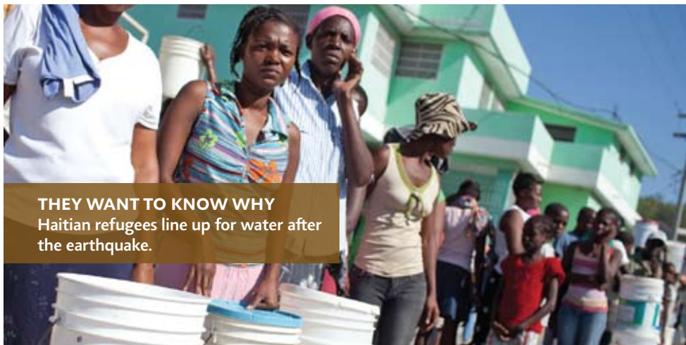
THEY WANT TO KNOW WHY Haitian refugees line up for water after the earthquake.

When the next tragedy inevitably occurs, let us be prepared to answer the question we will inevitably ask of God: What could we have done to prevent this?