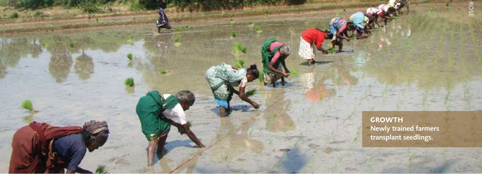
GROWTH Newly trained farmers transplant seedlings.

Sixty to eighty percent of the food produced in developing countries is grown by women, yet women own less than 10 percent of the land. 7 As the global food crisis continues, this paradox is becoming a deadly threat, undermining food security and costing lives around the world. By Sara Hahn