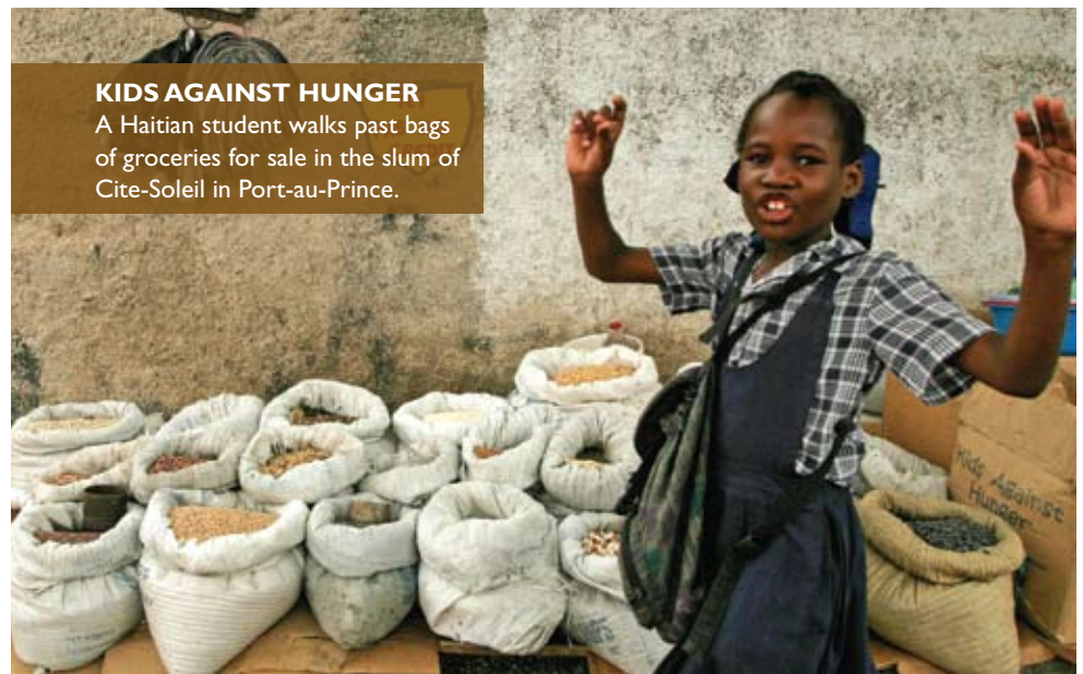
KIDS AGAINST HUNGER A Haitian student walks past bags of groceries for sale in the slum of Cite-Soleil in Port-au-Prince.

food production and distribution. “The international community must approach the food insecurity crisis not merely as an economic or agricultural challenge, but as a human rights issue,” she says. It is essential, for the survival of millions, to support food sovereignty, to empower local farmers to produce sustainable, plentiful staples for their own communities, and to ensure that our global surplus of food actually feeds those who need it most desperately. ■■