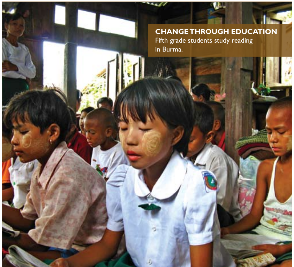
CHANGE THROUGH EDUCATION Fifth grade students study reading in Burma.

The summers of 2007 and 2008 changed my world view, fueled my human rights passion and pulled on my heartstrings in reflective and provocative ways. We can't quantify and order human rights abuses, nor would we ever want to, but we must identify them and hold the perpetrators accountable. The ethnic minority groups of Burma need peace and justice, education and fresh water, international concern and action. Identifying the hand behind the killing, both quick and slow, is the first step toward making peace, security and human rights 'normal' for all of the people of Burma. ■■