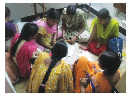
MEMBERS OF SHAHEEN RESOURCE CENTER FOR WOMEN

others to access the tools they need to stay safe, while working to change local attitudes about gender. For girls in these communities, it can be a challenge just to get permission to leave their homes to meet in the Girls Rise India center in the first place. Therefore, much of these leaders' work involves outreach to their own families, friends and neighbors to help them take advantage of Girls Rise India's efforts in the community, thereby gradually gaining acceptance as empowered young women. The girl leaders also talk to local education boards, health boards and law enforcement officials to promote the struggle against gender discrimination within these institutions and make them more responsive to violence against women and girls.