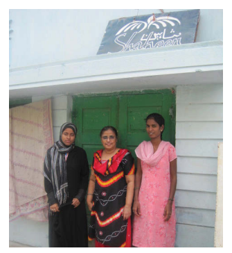
MEMBERS OF SHAHEEN RESOURCE CENTER FOR WOMEN