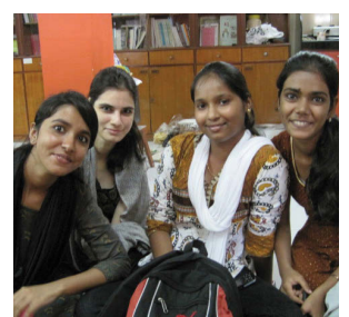
MEMBERS OF AWAAZ-E-NISWAAN