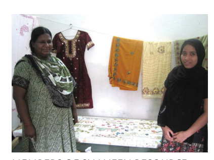
MEMBERS OF SHAHEEN RESOURCE CENTER FOR WOMEN

Empowered girls grow up to be empowered women who can raise their children in a violence-free environment, teach others about gender equality, contribute to raising the economic status of their families and communities, and hold their governments accountable for securing their rights. They become doctors, teachers, social workers, lawyers and community organizers. Most of all, they become agents of change for a new world—one that is free of violence—for the next generation of girls.