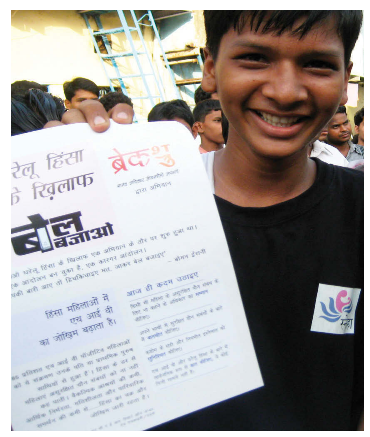
YOUNG MAN PARTICIPATES IN A WOMEN'S RIGHTS RALLY AGAINST DOMESTIC VIOLENCE IN MUMBAI.