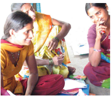
IN GUJARAT, YOUNG WOMEN TRAIN TO BECOME COMMUNITY HEALTH WORKERS.