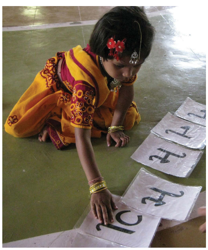
YOUNG GIRL LEARNS THE ALPHABET AT HER SCHOOL IN DHARAMPUR, GUJARAT.

To ensure that girls have equal opportunities and are free from discrimination requires an empowered local civil society that can advocate for better policies, laws and enforcement. Further, it requires that countries giving