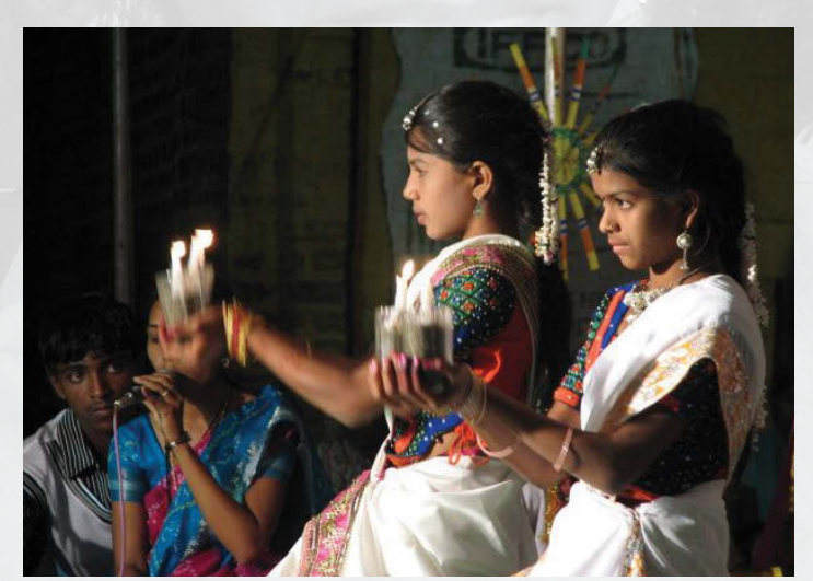
GIRLS PERFORM A TRADITIONAL DANCE AT A CELEBRATION HONORING MAHATMA GANDHI IN GUJARAT.

Imagine the world of a 12-year-old girl in your town or city.