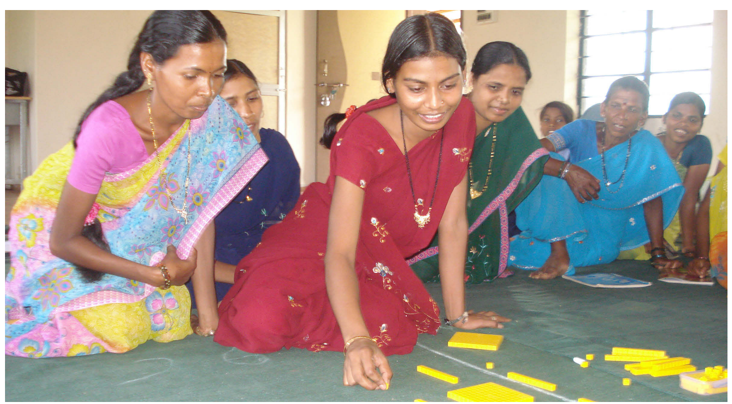
IN A RURAL VILLAGE IN GUJARAT, GIRLS LEARN MATH THROUGH HANDS-ON METHODS.

Because it employs a rights-based approach, AEN pairs its outreach to women and girls with organized campaigning to directly confront the marginalization that fuels the poverty and violence in their daily lives. In 1999, AEN held a national conference on Muslim women's rights, which resulted in the formation of the Muslim Women's