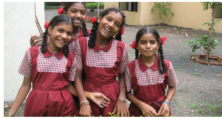
SCHOOL GIRLS ATTEND A CO-ED EDUCATION CAMP IN DHARAMPUR, GUJARAT.