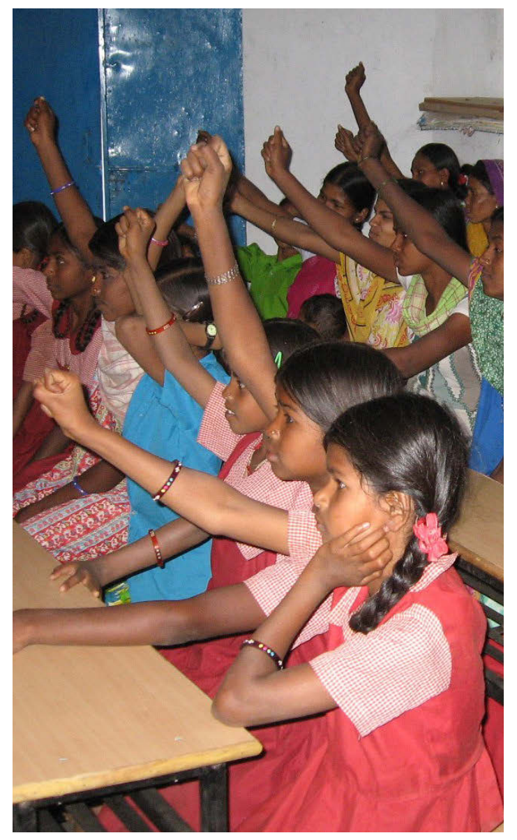
GIRLS PARTICIPATE IN A HEALTH EDUCATION CLASS AT A RURAL SCHOOL IN GUJARAT.