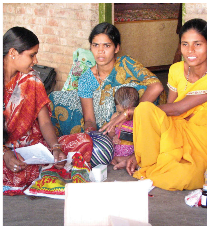
IN GUJARAT, COMMUNITY HEALTH WORKERS PARTICIPATE IN TRAINING.

Girls Rise India is a small community-based organization dedicated to stopping the violence and gender-based discrimination experienced by Muslim and Dalit<sup>7</sup> women and girls. Girls Rise India operates in a highly sensitive setting where, due to restrictions set forth by traditional religious beliefs, women and girls experience extremely limited mobility outside their own homes and within their communities. These girls are often married shortly after puberty without any knowledge or education of gender and sexual relations—leaving them highly vulnerable to abuse and exploitation. Unsurprisingly, they report that violence within their homes and communities is one of the greatest impediments they face to overcoming poverty.