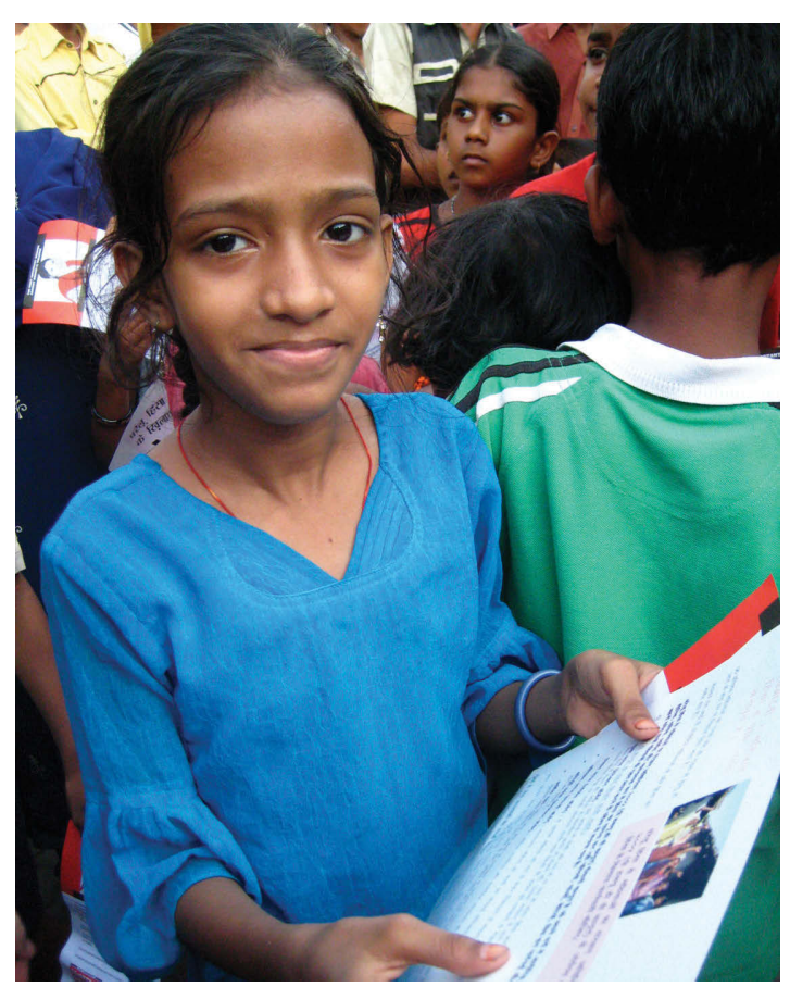
GIRL ATTENDS A RALLY AGAINST DOMESTIC VIOLENCE IN MUMBAI.

SNEHA also applies this participatory approach to monitoring implementation of existing laws. The Indian Protection of Women from Domestic Violence Act of 2005 entitles victims of violence to immediate services, such as medical treatment and shelter, and establishes judicial mechanisms to prosecute cases of domestic violence, rape, threats, sexual harassment and economic abuse. It also delineates standards of conduct for police officers, including awareness and sensitivity training, and contains a budget requirement for implementation. This law is not being sufficiently implemented, however, and violence is still condoned in many Indian communities. SNEHA monitors cases of violence and ensures that victims receive care and services, and that perpetrators are brought to justice under the law.