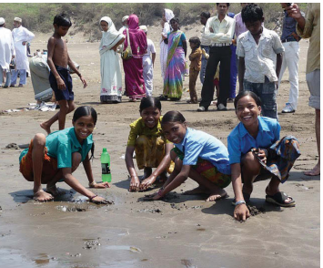
YOUNG GIRLS TAKE PART IN EDUCATION PROGRAMS IN RURAL VILLAGES IN GUJARAT.