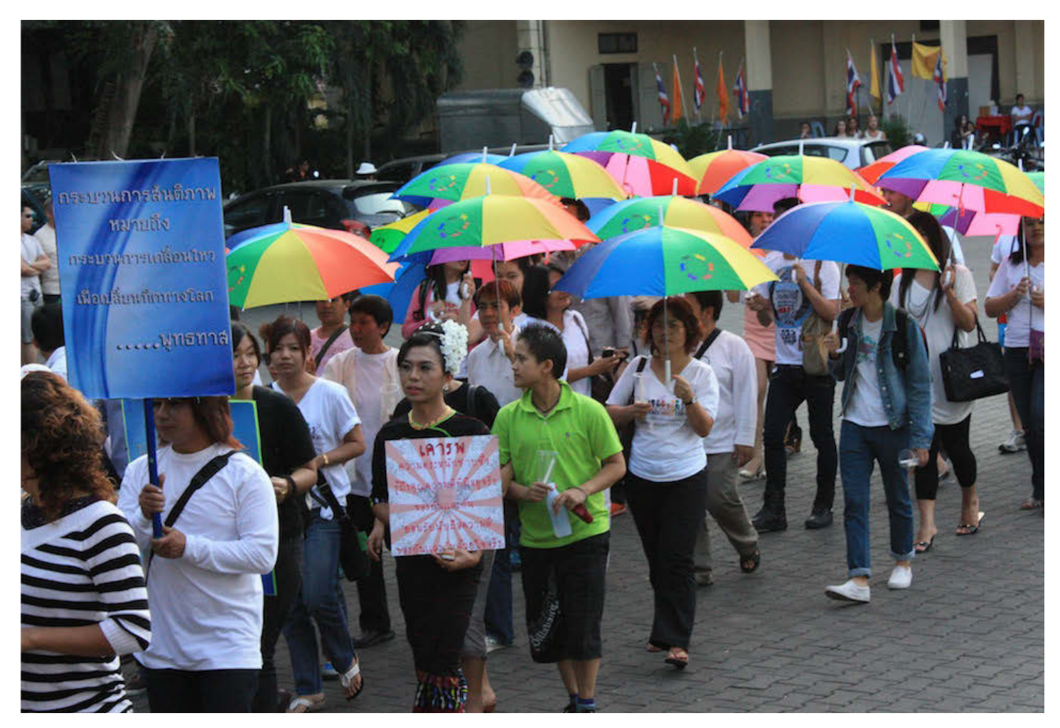
SAO-SAO-ED, PARTICIPATING IN AN LGBTI RALLY IN THAILAND.

In addition, AJWS provides small grants from earmarked emergency funds to enable HRDs to increase their physical security. This may include support to help HRDs install video cameras in their offices, pay legal fees, receive medical care, relocate, obtain immediate psychosocial support and/or secure food and shelter while they are in hiding.