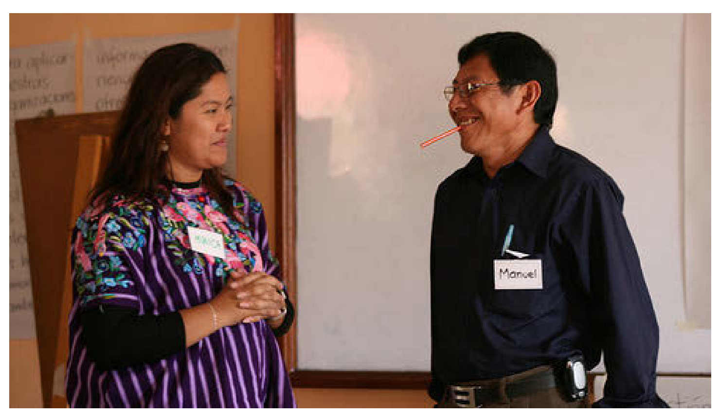
MEMBER OF ALIANZA MAYA PARA LA EDUCACION POPULAR, GUATEMALA, PARTICIPATING IN A WELLNESS TRAINING.

supporting security is too complex because of the gravity of security decisions—lives are at stake, and funders do not have the training to effectively assess security risks. However, the persecution of HRDs is a real, identifiable problem that has been acknowledged by the international community. AJWS welcomes continued dialogue with other funders on the issues and strategies raised in this paper as we move toward our goal of offering stronger protection and support of the courageous activists defending human rights around the world.