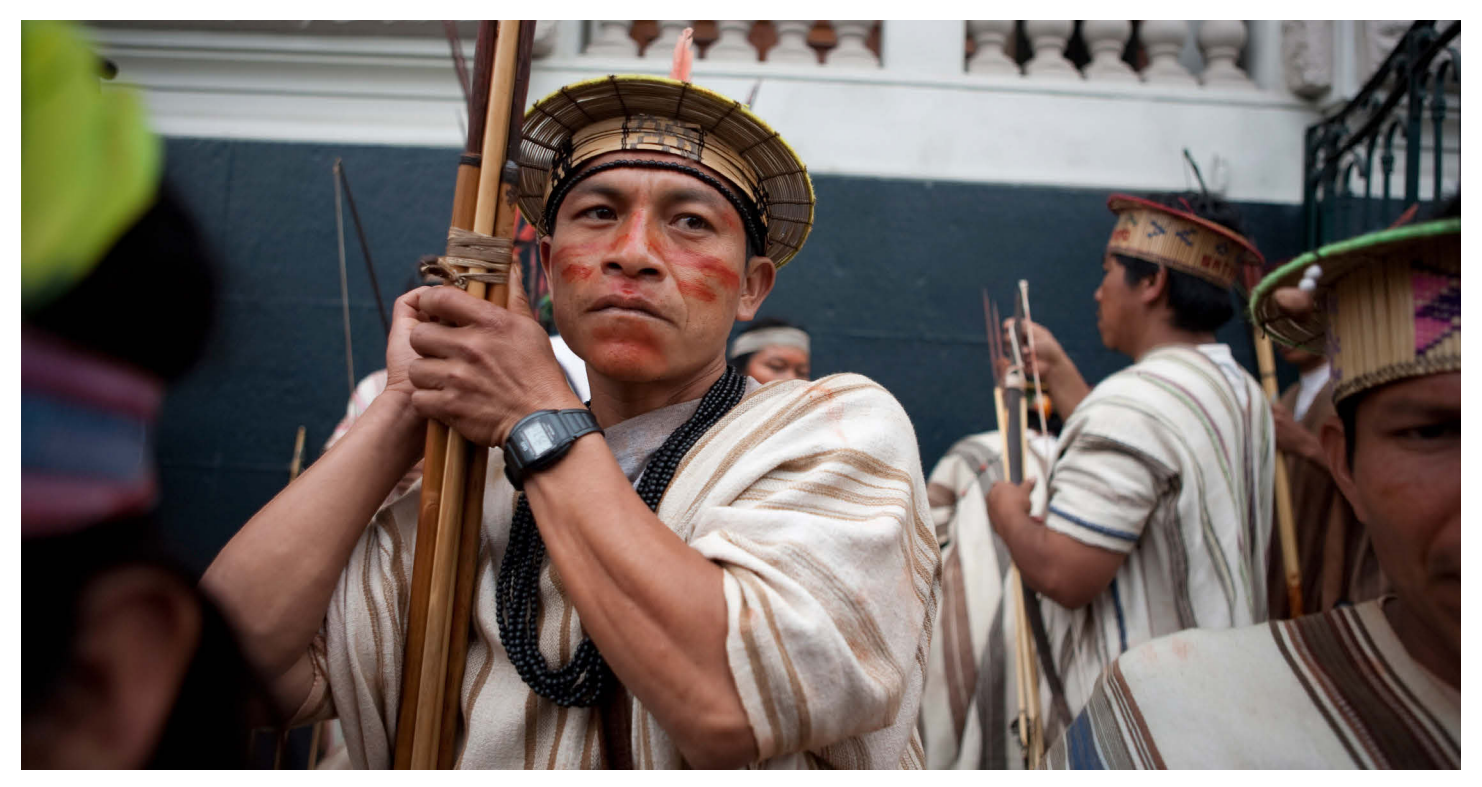
MEMBER OF ASOCIACION INTERETNICA DE DESARROLLO DE LA SELVA PERUANA, AFTER WITNESSING AN HISTORIC AGREEMENT WITH THE PERUVIAN CONGRESS.