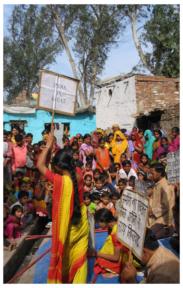
KISLAY, INDIA, HOLDING A RALLY IN A SLUM SCHEDULED FOR DEMOLITION.

Human rights defenders utilize a variety of measures to protect themselves. They may vary their travel routes to and from work; relocate or go into hiding; or create communication strategies that allow them to stay in touch with their colleagues when traveling. Others reach out to friendly organizations and powerful individuals or attempt to raise their public profile so that any harm to them will be noticed and denounced in the press. These actions can prove extremely effective, but in many cases more is needed. Limited funds mean that many HRDs do not have the resources necessary to respond sufficiently to threats, strengthen security systems or develop long-term security plans.