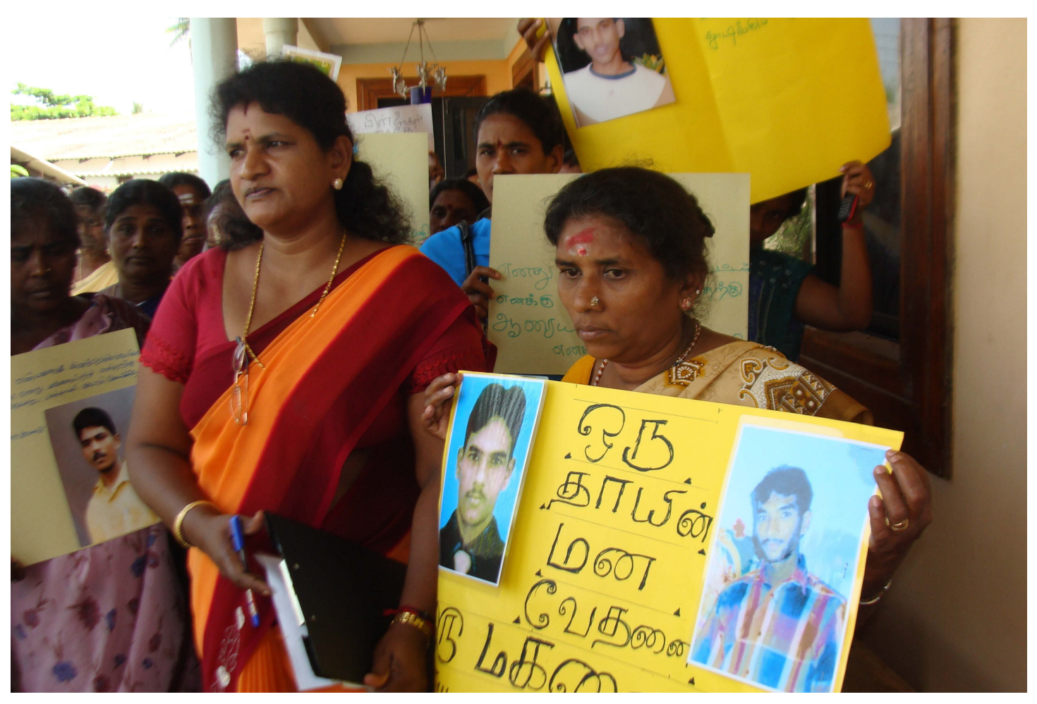
CENTRE FOR PROMOTION AND PROTECTION OF HUMAN RIGHTS, SRI LANKA, HOLDING AN EVENT ON INTERNATIONAL WOMEN'S DAY.

The director of an AJWS grantee and another member of the convoy were killed. The activist left behind a husband and two young children. In what ways could AJWS be most supportive, as a grantmaker, after her death? When a grantee is injured or killed because of his or her work, should the grantmaker provide support to his or her family, and what kind of support or action is most appropriate?