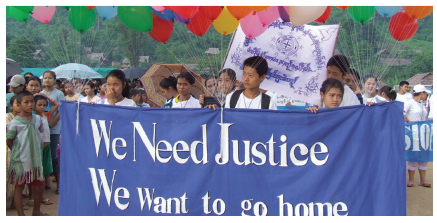
AJWS partner Karen Student Network Group participates in an event for 2007 World Refugee Day, Thailand.

Organization (ILO) began to monitor forced labor in Burma and, in 2007, after intense negotiations, the Burmese government signed an agreement establishing a complaint mechanism, where a Burmese citizen can lodge a complaint through the ILO with no risk of redress or retaliation.<sup>3</sup>