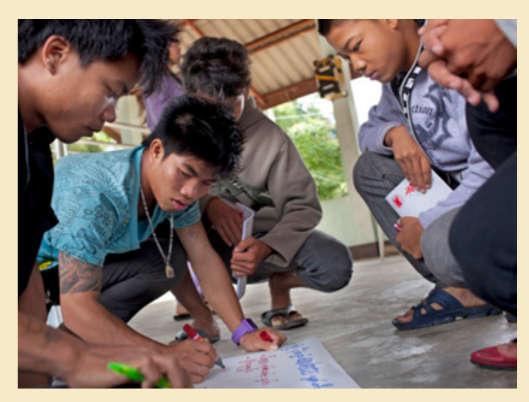
Shan Youth Power conducts a training with local youth.

AJWS recognized the potential of these groups to bring about change and has consistently supported their efforts over the last decade, helping the movement grow stronger and more numerous. We began funding several organizations along the Thai/Burmese border in 2002 and, today, we fund 30 organizations both along Burma's borders and inside the country.