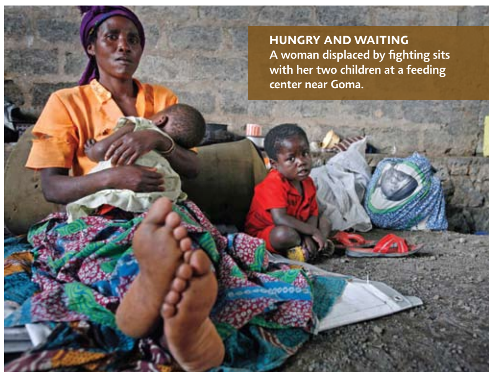
HUNGRY AND WAITING A woman displaced by fighting sits with her two children at a feeding center near Goma.

In the meantime, he thinks that salvation can come on an individual level: “As an African, as a Congolese, I don’t have money to give them, I don’t have power, but if I can save the lives of one or two children, that is my contribution to my community. Five million people have died as a result of the conflict in Congo. It’s time to think about doing as much as we can for ourselves.” ■