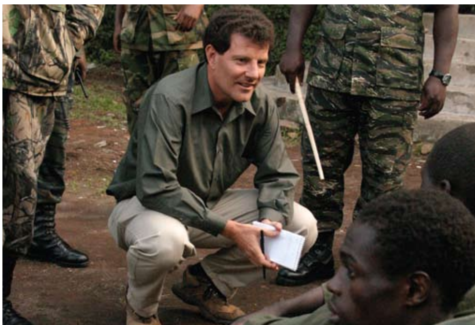
ABOVE Kristof with POWs, including a child soldier, at General Nkunda's camp.

I agree that a boycott of coltan isn't feasible, but we can demand an end to exports of Congolese coltan through Rwanda or neighboring countries. We should also put more pressure on regional governments. Paul Kagame, the president of Rwanda, has done a superb job running his country and he cares about international opinion—so we should hold his feet to the fire for his behavior in Congo. It was probably because he did feel pressure that his troops recently arrested General Nkunda, the warlord he had previously supported, in a move that may mark a step toward security. We can also demand that Kagame do more to encourage the repatriation of Hutus in Congo to defuse the warfare there, and ensure that Rwanda doesn't see eastern Congo simply as its buffer zone. Kagame depends on the U.S. and we should use that leverage to help the people of Congo escape from their "Hell on Earth."