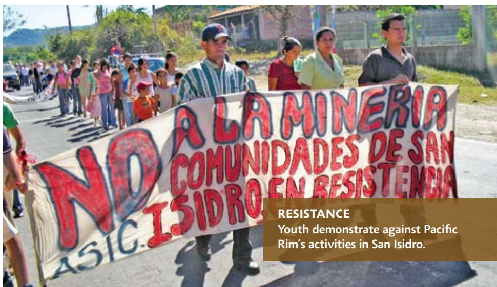
RESISTANCE Youth demonstrate against Pacific Rim's activities in San Isidro.