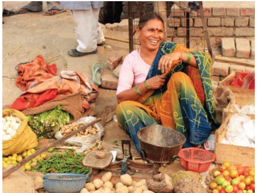
DIVERSITY ON FILM These photographs, taken by participants in AJWS's fall Study Tour to India, capture daily life in Mumbai's slums.