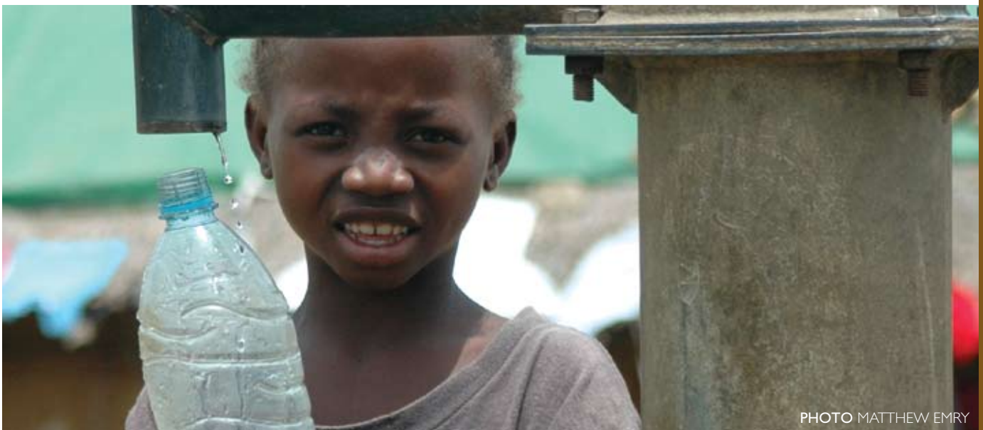
SAFE REFUGE A girl drinks from an IDP camp well in in Jajtondo Town, Liberia.