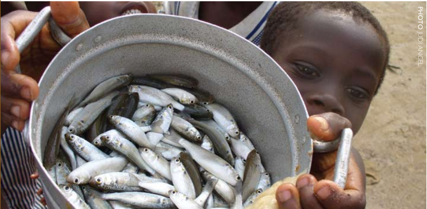
SUSTAINABLE LIVELIHOOD Selling fresh fish in Ghana.