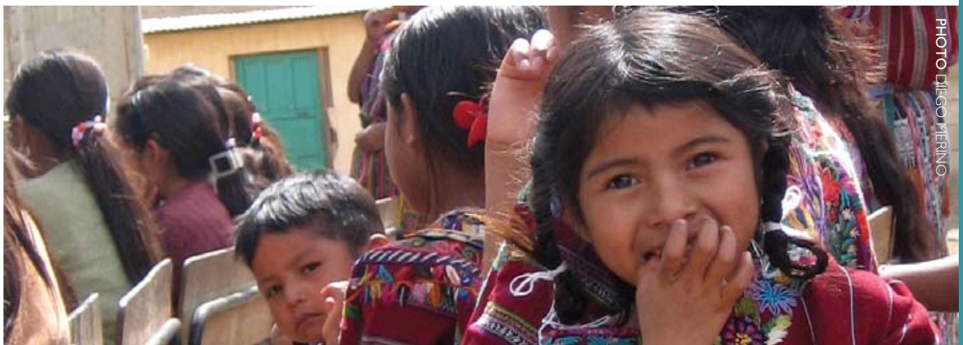
WOMEN'S EMPOWERMENT A Mayan girl participates in an event held by AJWS grantee FESIRGUA, which works to develop leadership and safety for women and girls in Indigenous communities in central Guatemala.